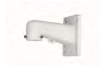
DH-PFB305W Wall mount bracket